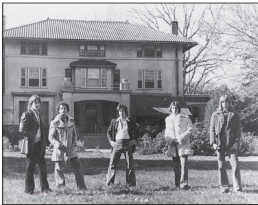
“The Mansion”, fabled home of Adonis band and crew. Lost in a fire June 17, 1979.